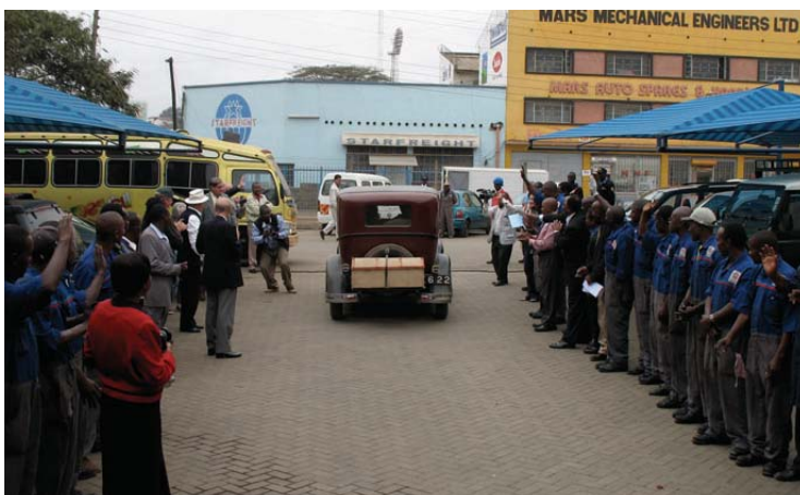
Leaving Nairobi on a cold July morning