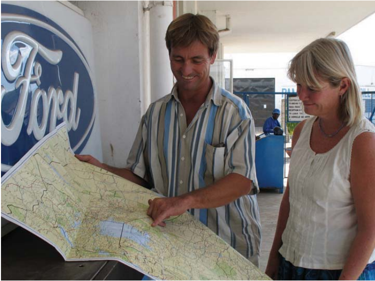
Looking at possible routes for the epic trip.